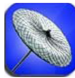
One type of Septal Occluder

Once your doctor is happy with the placement, the catheter will be removed and the entry site will be closed.